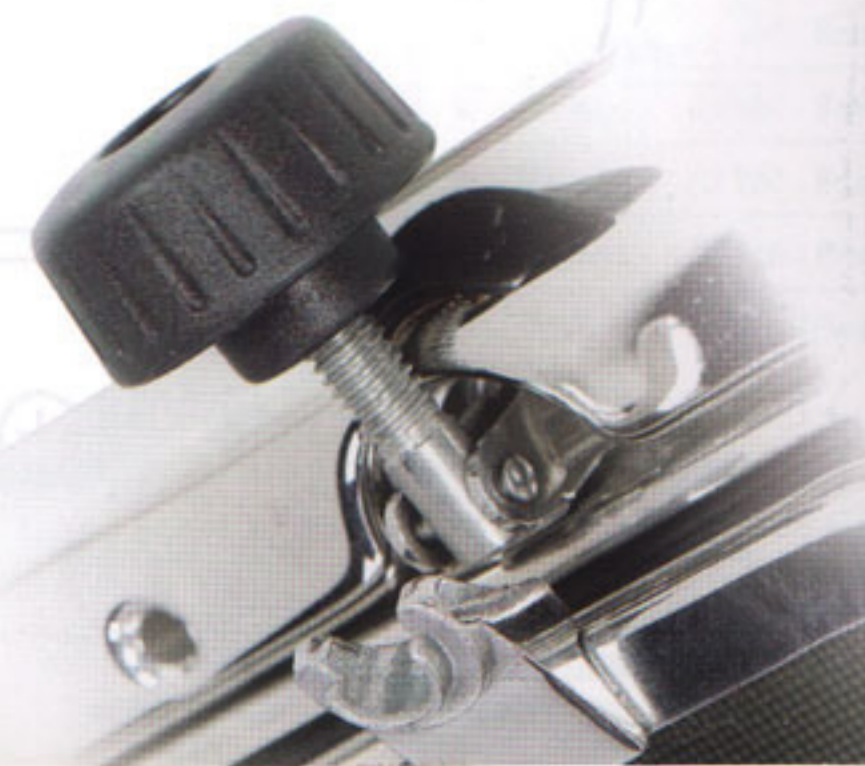
Photo credits: Helsen Signature 47 Specifications subject to change without notice